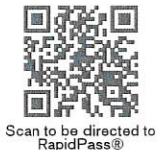
Scan to be directed to RapidPass®

Streamline your donation experience and save up to 15 minutes by visiting RedCrossBlood.org/RapidPass to complete your pre-donation reading and health history questions on the day of your appointment.